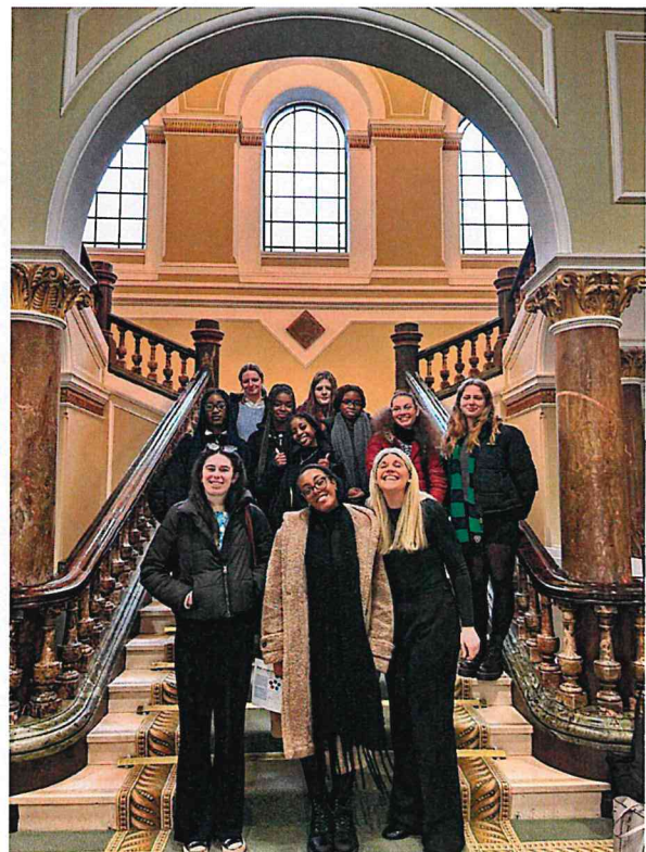
Visit to the Council House

"Being a Student at St Paul's Sixth Form, You have a great support system and there is so much help available. The lessons are interactive, and you have opportunities to ask many questions and develop your subject knowledge. You are supported by so many staff and if there are worries then there's always someone to talk to."